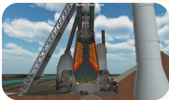
Blast Furnace Simulations and Visualizations continue to be developed by CIVS for optimization, troubleshooting, and virtual training.