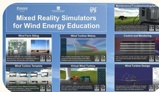
A Suite of simulators for wind energy education was developed by CIVS through a grant from the U.S. Department of Education.